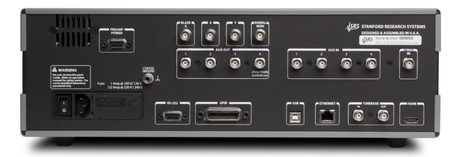
SR860 rear panel