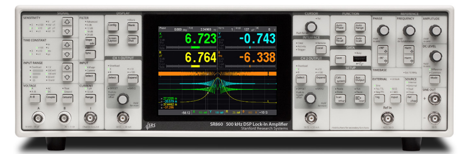
SR860 front panel