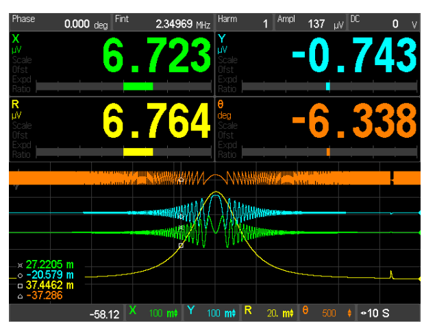
Large numeric readout with strip chart recording

The SR860's effective dynamic reserve is simply the ratio of these two settings. For instance with a 10\,\text{nV} sensitivity setting and a 300\,\text{mV} input range the effective dynamic reserve of the SR860 is 3\times10^7 , or nearly 150\,\text{dB} .