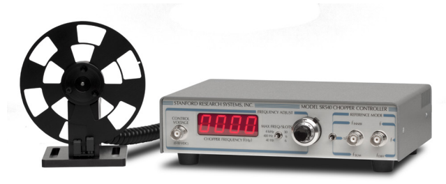
SR540 Optical Chopper

Synchronous filtering may also be selected at reference frequencies below 4 kHz. The synchronous filter notches out multiples of the reference frequency and is extremely useful in making low frequency measurement where multiples of the reference frequency would otherwise show up in the lock-in output. Unlike previous designs the synchronous filter in the SR860 can be selected with no loss of output resolution.